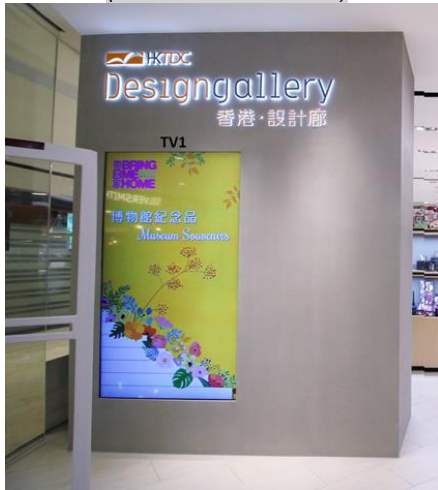
TV1 65" (across from GODIVA)