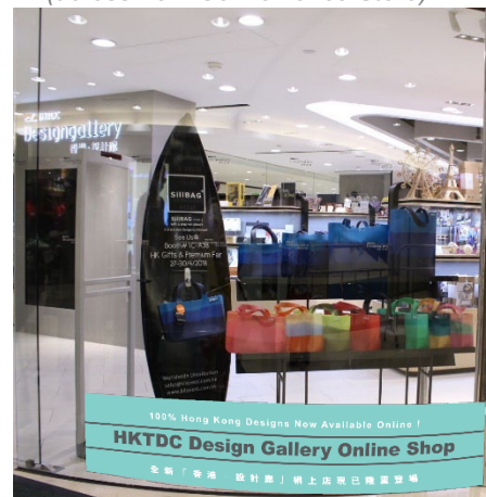
Zone D with Window Sticker Dimension: 100cm(W) x 100cm(D) (across from Convenience Store)