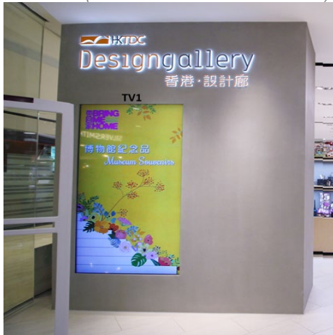
TV1 65" (across from Convenience Store)