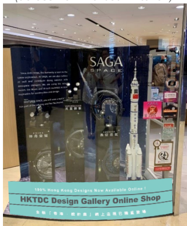
Zone B with Window Sticker Dimension: 100cm(W) x 100cm(D) (across from Harbour Kitchen)