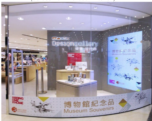
Zone C1 to C2 with Window Sticker Dimension: 150cm(W) x 130cm(D) (across from Harbour Kitchen)