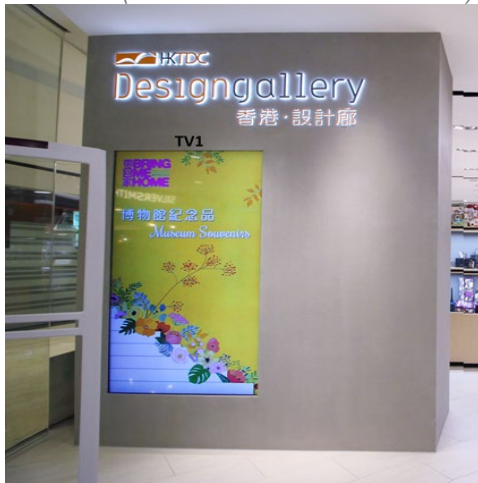
TV1 65" (across from Convenience Store)