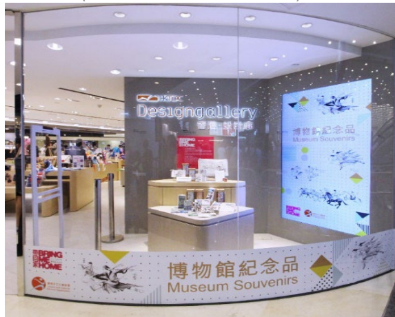
Zone C1 to C2 with Window Sticker Dimension: 150cm(W) x 130cm(D) (across from Harbour Kitchen)