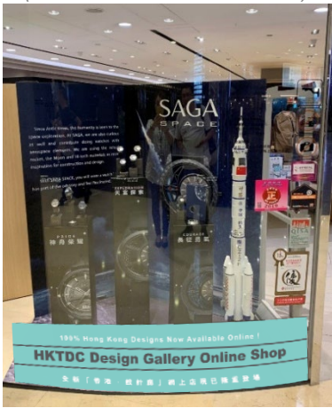
Zone B with Window Sticker Dimension: 100cm(W) x 100cm(D) (across from Harbour Kitchen)